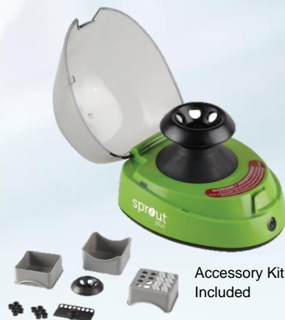
Accessory Kit Included