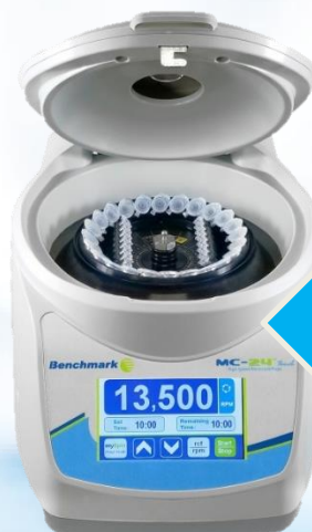
Snap-on rotor lid included